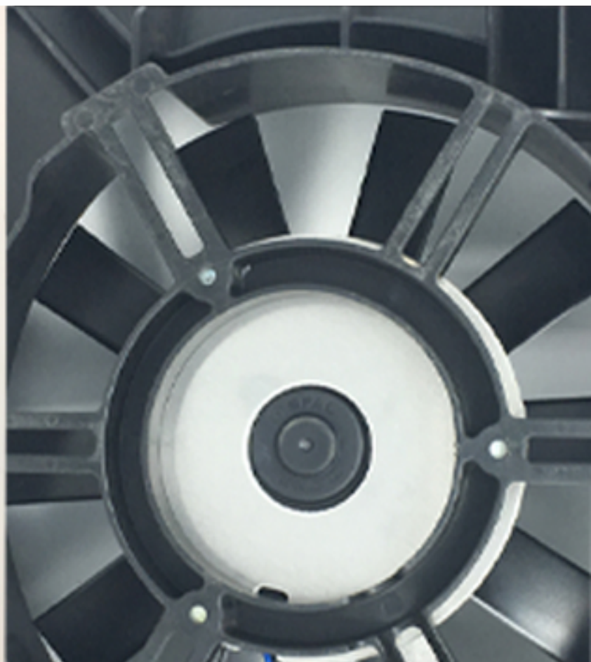
May need to remove orig OE connector and reuse on new motor wiring pins.