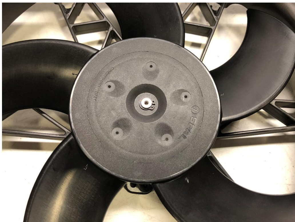
ALIGN BLADE GROOVE TO SIT OVER PIN AND SECURE WITH LOCK RING INSTALLATION IS NOW COMPLETE