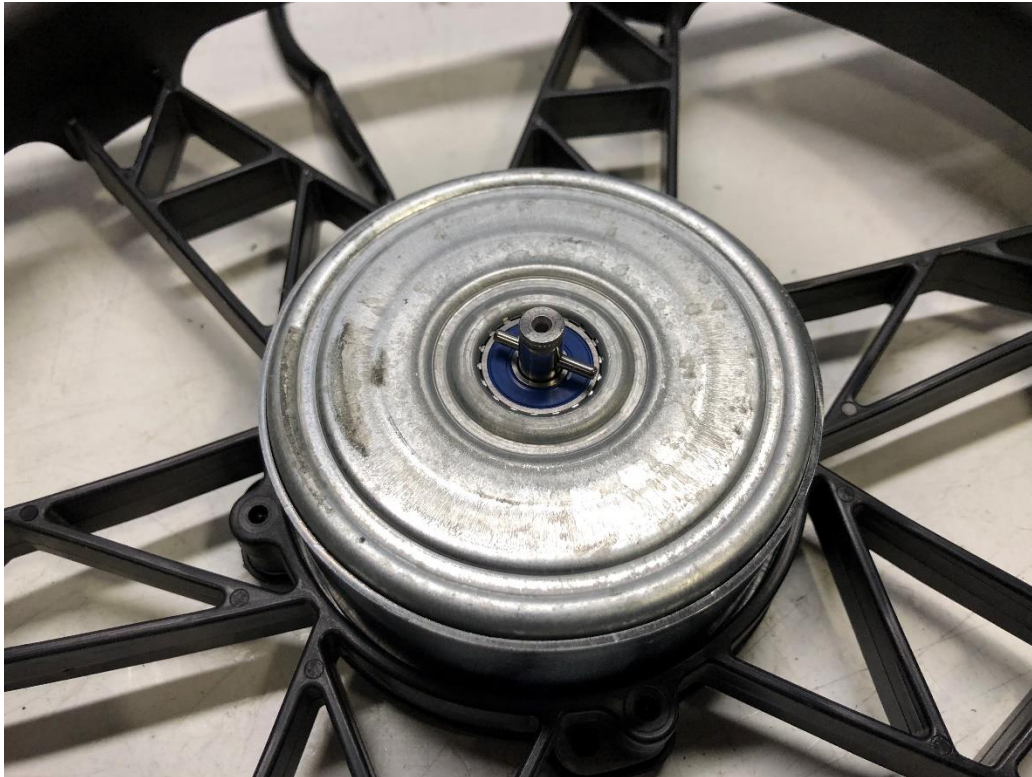
SLIDE PIN (PROVIDED) IN SHAFT